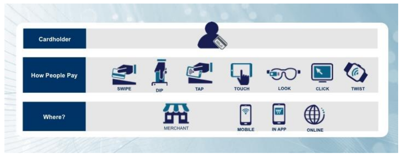
Figure 1. Current Payment Options for Consumers

Card payment options for consumers have changed radically since the 1960s–1970s, when the only choices were magnetic-stripe plastic cards and relatively simple merchant terminals and ATMs. Figure 1 illustrates the numerous payment options now available.